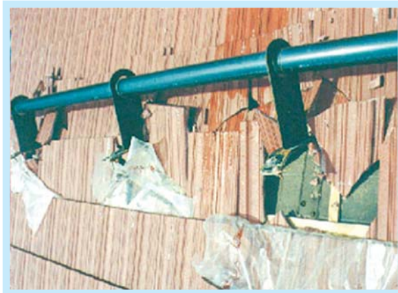
Photos 4 and 5: Snow fences used alone were not able to prevent damage.